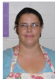
Michelle Bird Cafeteria